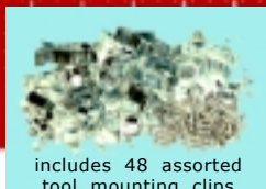
includes 48 assorted tool mounting clips