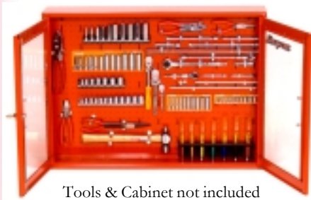
Tools & Cabinet not included

Wall cabinet Tool Mounting Board provides a versatile, secure system for tool control when used with Snap-on® wall cabinets (KRA270C or KRA276D).