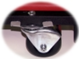
Leaf spring shock absorbers

Most techs slam their creeper to the ground & this can be tough on the casters. The leaf spring shock absorbers on the JC45B inhibits the loosening of casters as a result of dropping the unit or rolling over rough areas.