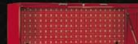
KRW7572A Riser with Door Pre-assembled at Factory