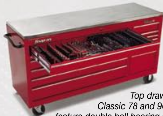
Top drawers on the Classic 78 and 96 roll cabs feature double ball bearing slides and four support stiffeners for 250 lb. capacity.

Our drawers make your job easier, with the largest variety of sizes and larger pulls for more finger space. Position your drawers any way you want, with 2 inch mounting centers on the whole box and quick disconnect slides. You can add more drawers anywhere on the roll cab or top chest. You can't do that with most competitive boxes. These drawers feature aluminum drawer trim — not plastic like many other brands.