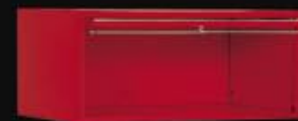
KRWL3635 Bulk Storage Top