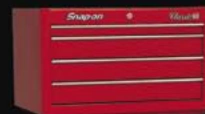
KRA2404 Top Chest