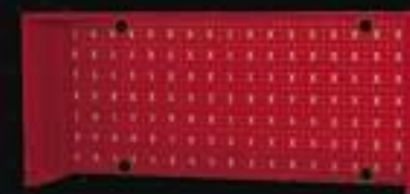
KRW7554A Riser with Door Pre-assembled at Factory