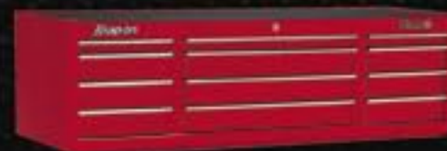
KRA2412 Top Chest