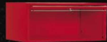
KRWL3635 Bulk Storage Top (2 required)