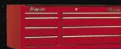
KRA2408 Top Chest