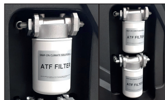
• 2 large fine filters