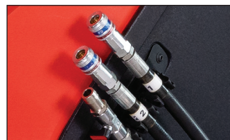
• High quality connectors