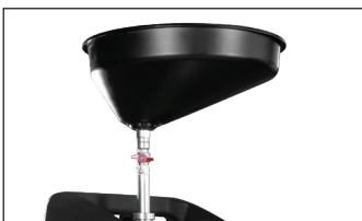
• Smart-Drain System

A scale for the cleaner provides the highest accuracy and precision compared to other systems. Using a scale avoids the risk of the pump sucking in air while injecting additives and removes the constant need to purge the pump