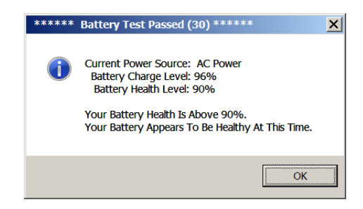
Error Code 40

Battery Is Worn But Passed Battery Test.