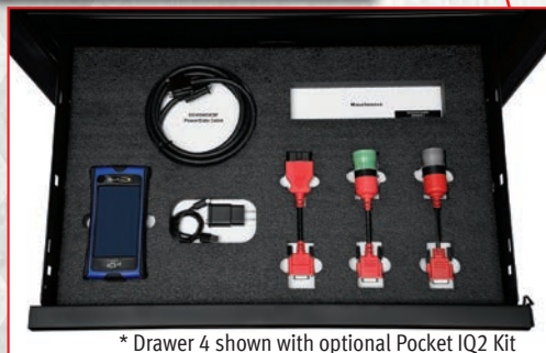
* Drawer 4 shown with optional Pocket IQ2 Kit