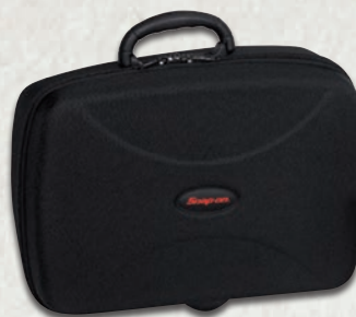
EEHD189090 (shown above) PRO-LINK® Edge Scan Tool Starter Kit