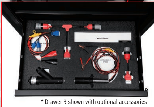
* Drawer 3 shown with optional accessories