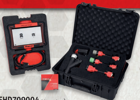
EEHD709004 (shown above) PRO-LINK® Edge Scan Tool Master Kit