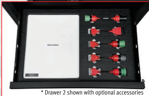
* Drawer 2 shown with optional accessories