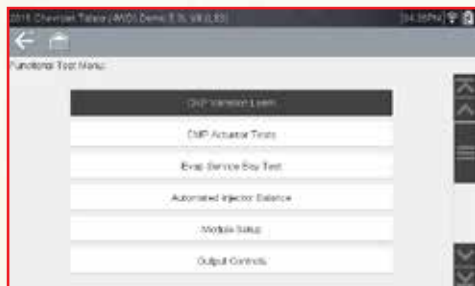
Use bidirectional controls while viewing live data for true cause and effect diagnostics.