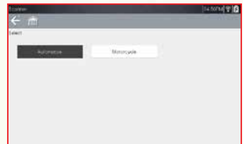
Coverage for 49 automotive makes and nine OEM motorcycle makes.