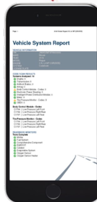
Pre-scan Report (Before)