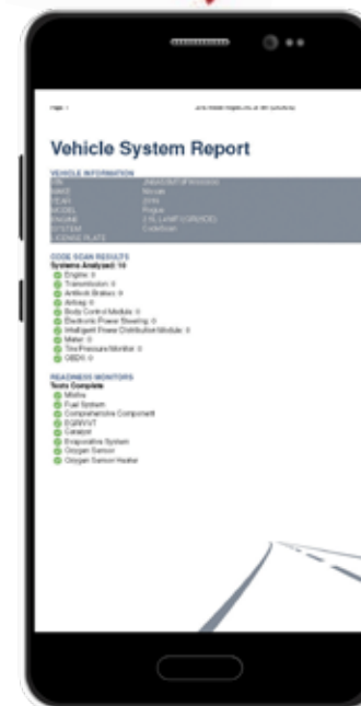
Post-scan Report (After)