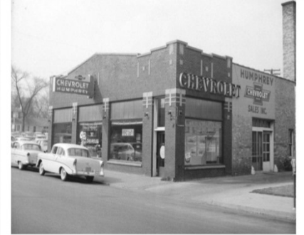
Lynch Dealership, 1956