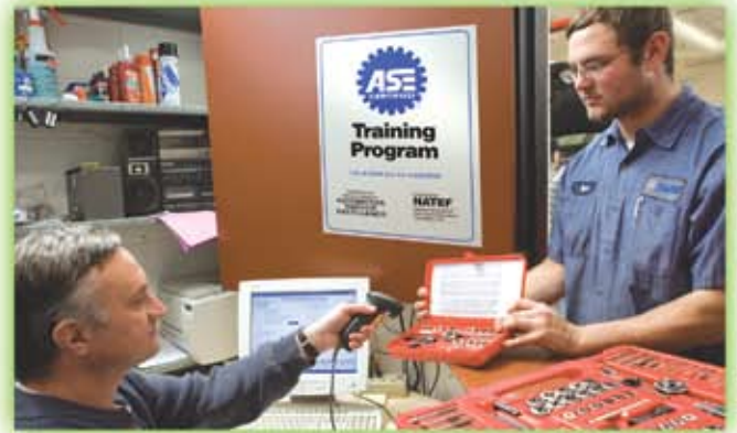
Streamline your parts department or tool crib with TCMMax asset management software. You'll know at a glance "who, what, where and when". For training situations, TCMMax can also be used for task tracking to provide students with data on their efficiency.

With TCMMax, the savings start immediately, and keep adding up. It's all about lean processes today, and TCMMax definitely speaks that language.