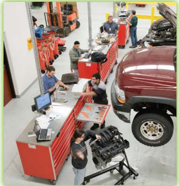
Who has it? What did they do with it? When did they take it? What job do we invoice for it? TC Max has all the answers – and now, so do you. TC Max asset management software gives you the total picture at all times, whether your operation is large or small.

A well-organized sign-out system. We think it starts with a well-organized page. And ours is as simple and intuitive as it gets. One screen covers both issue and turn-in. And with our unique audio prompt/command system, we even tell you what's going on.